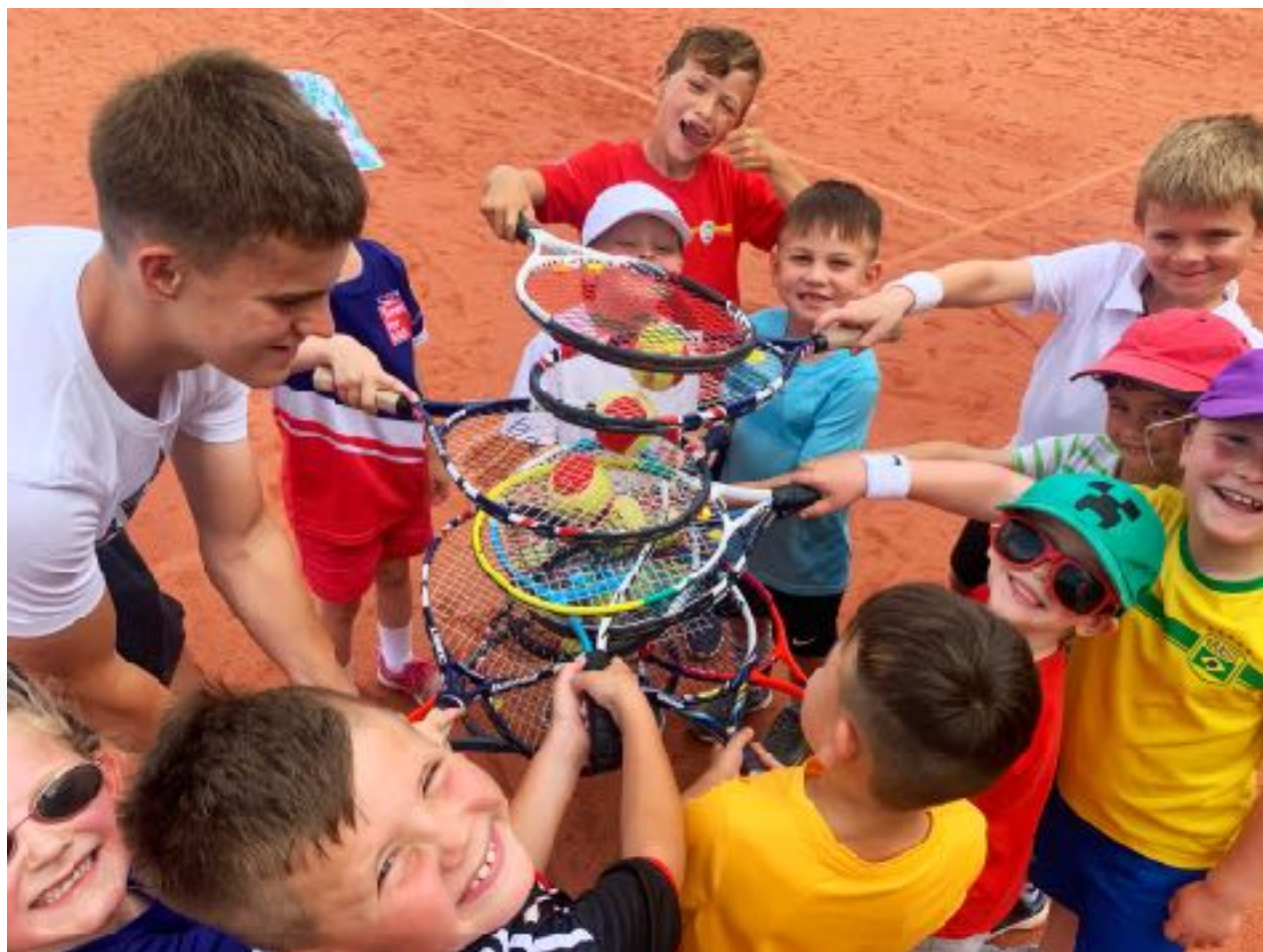
One of our fantastic groups of junior tennis stars during a session this Summer.